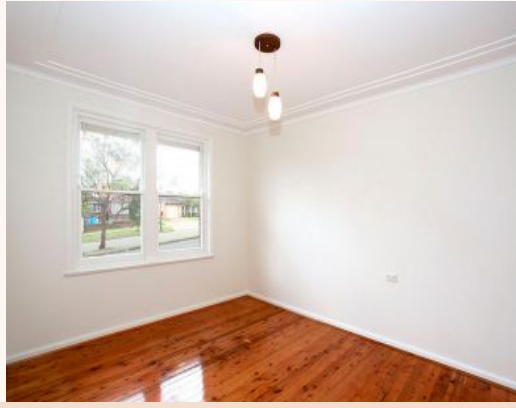
1 Clayton Street RYDE, NSW