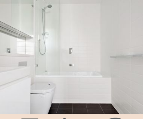
211/6 Shout Ridge Lindfield, NSW