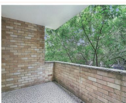
5/267 Victoria Avenue Chatswood, NSW