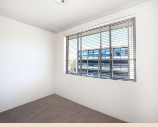
8/5 Reserve Street WEST RYDE, NSW