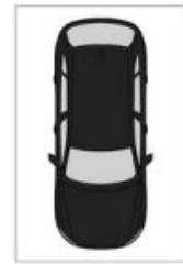
Outdoor Car Space 5.4 x 3.6 (Not In Position)