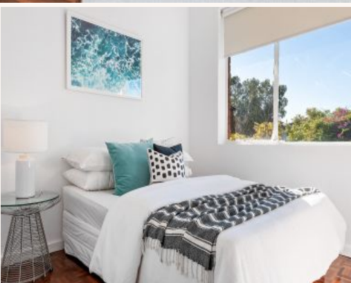
14/6 Isabel Street Ryde, NSW