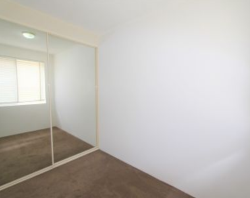
2/7 Reserve Street West Ryde, NSW