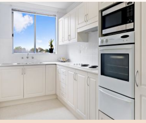
7/72 Day Street Drummovne, NSW