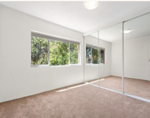
2/14 Curzon Street Ryde, NSW