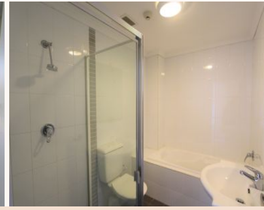
37/32-34 Mons Road Westmead NSW