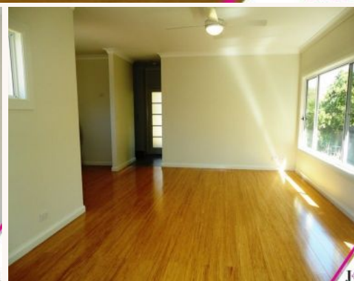
6 Dalton Avenue Eastwood, NSW