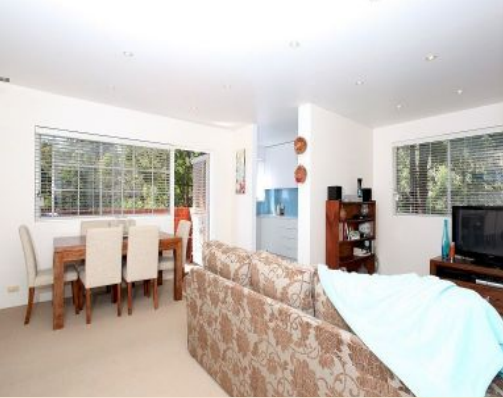
45/2 Leisure Close Macquarie Park, NSV