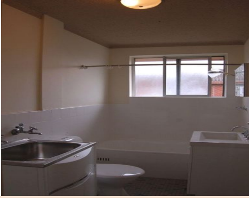
11/15 Reserve Street West Ryde, NSW