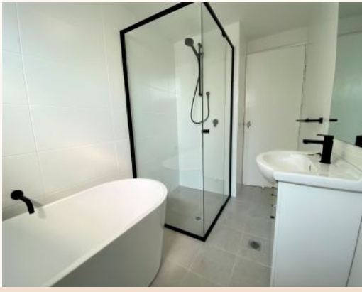
3/22 Orchard Street West Ryde, NSW