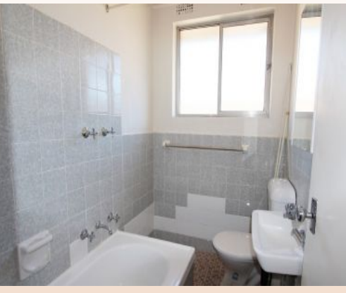
10/7 Reserve Street West Ryde, NSW