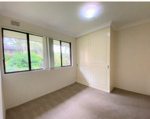
9/10A Tuckwell Place Macquarie Park, NSV