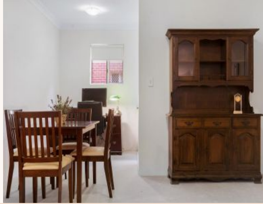
2/12-14 Gaza Road West Ryde, NSW