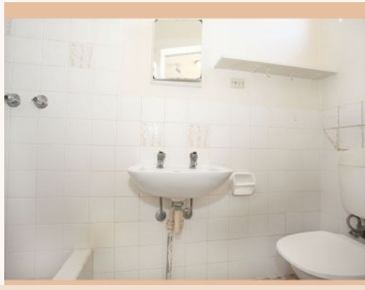
8/7 Bank Street Meadowbank, NSW