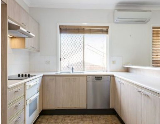
6/58 Anthony Road Denistone, NSW