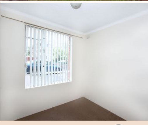
5/3 Terry Road West Ryde, NSW