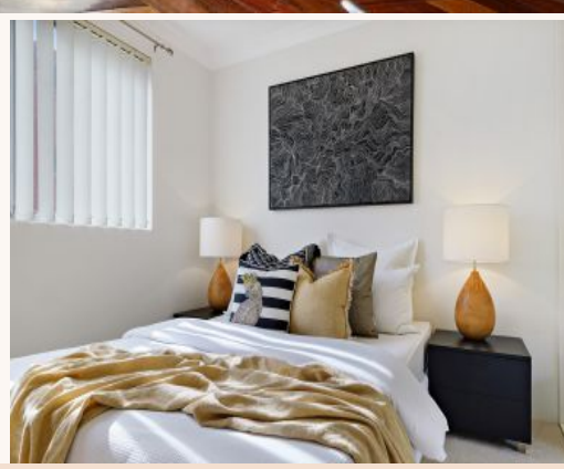
6/5-7 Riverview Street West Ryde, NSW