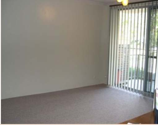
2/1 Stewart Street Glebe, NSW