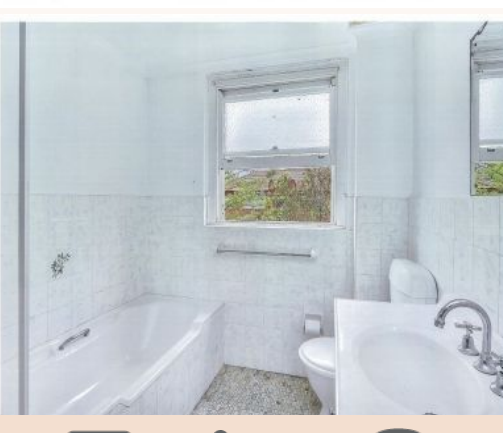
5/267 Victoria Avenue Chatswood, NSW