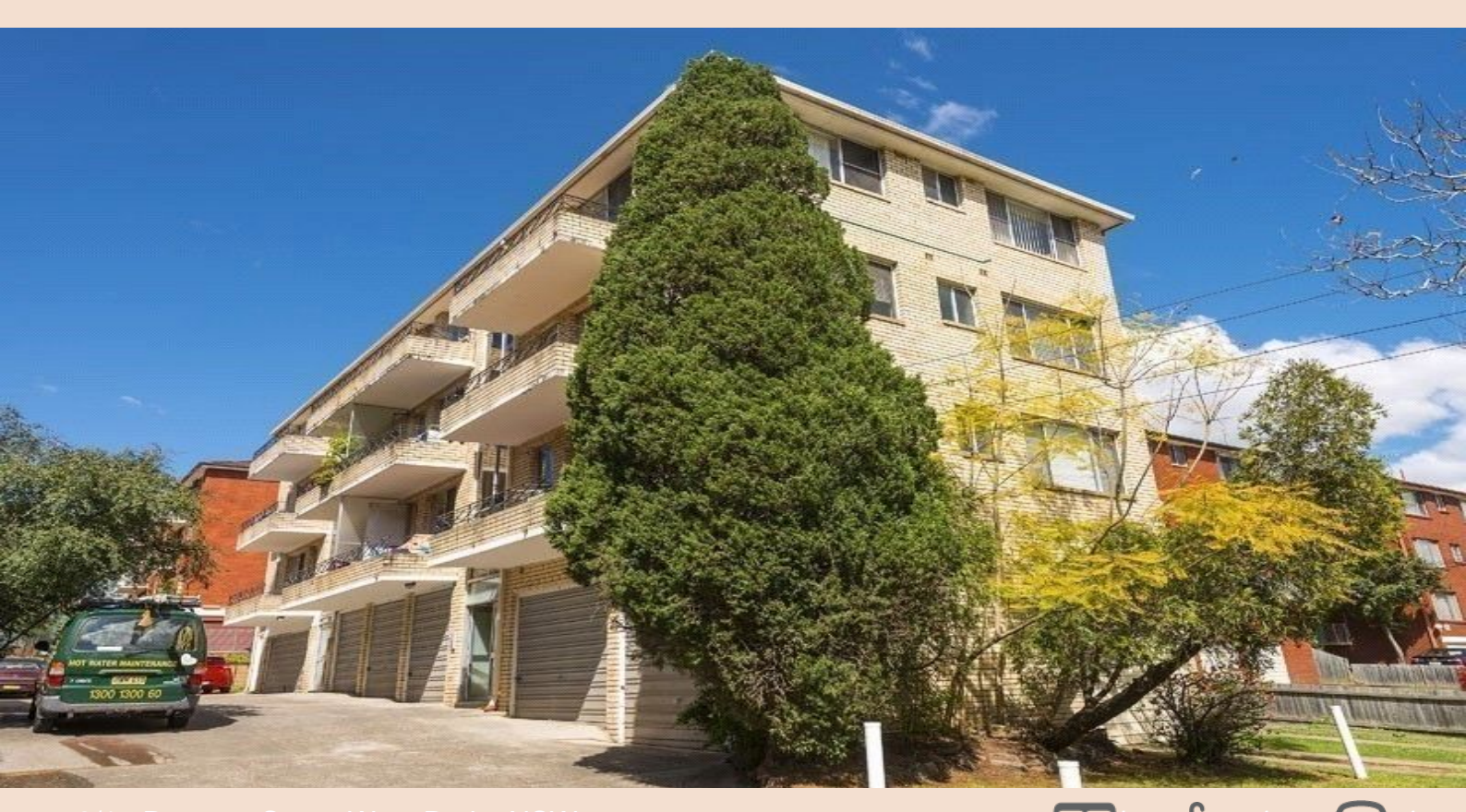
3/17 Reserve Street West Ryde, NSW