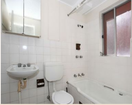
3/40 Forster Street West Ryde, NSW