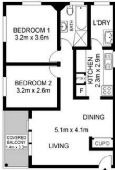
RAISED GROUND LEVEL