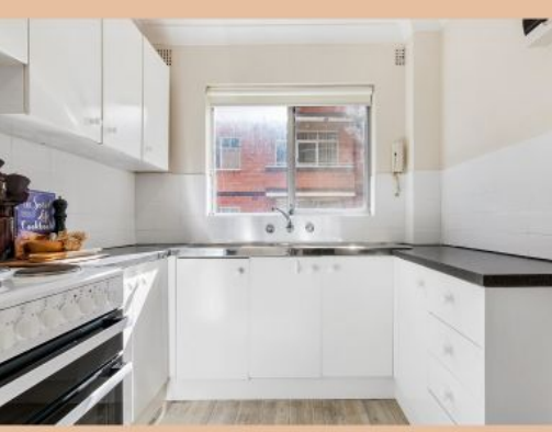
2/13 Curzon Street Ryde, NSW