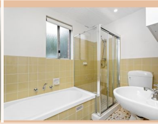
4/11 Curzon Street Ryde, NSW