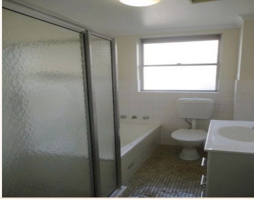
30/275 Blaxland Road Ryde, NSW