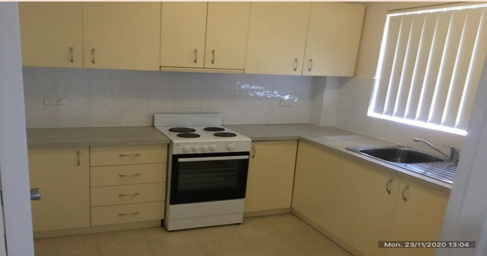
8 / 42 Forster St. West Ryde