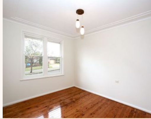
1 Clayton Street Ryde, NSW