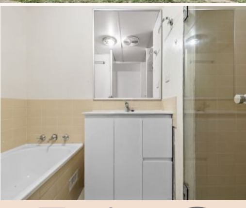
4/8 Hatton Street Ryde, NSW