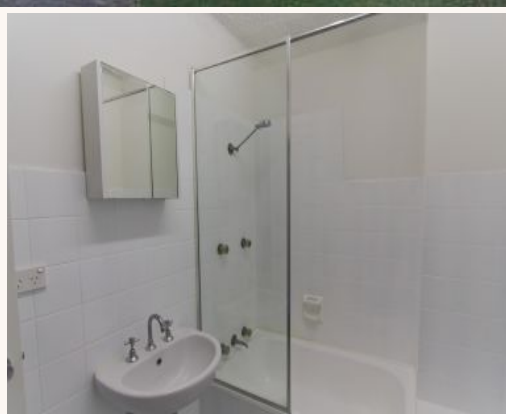
44/11-17 Church Street Ryde, NSW