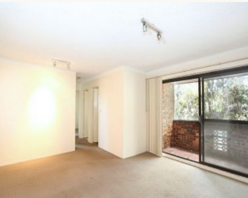
15/1 Peach Tree Road Macquarie Park, NSV