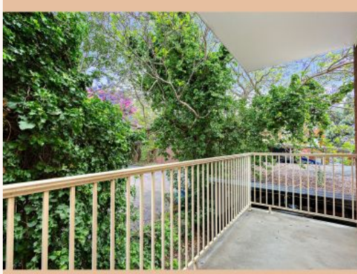
10/8 Isabel Street Ryde, NSW