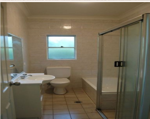
3/63A Waterview Street Putney, NSW