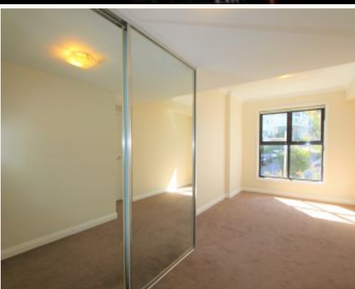
64/141 Bowden Street Meadowbank, NSW