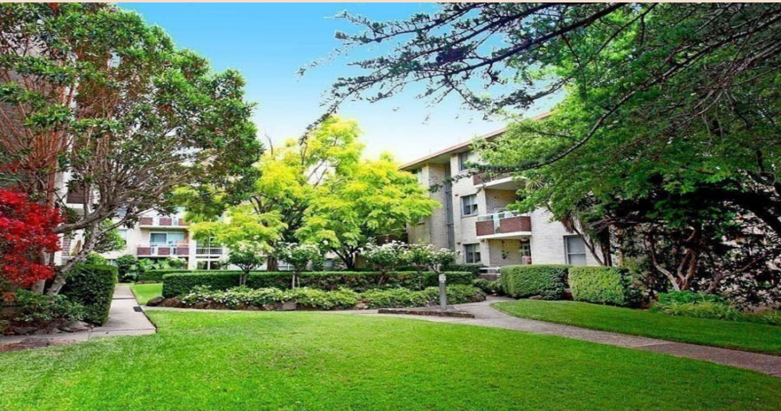
74 / 11 - 17 Church Street Ryde