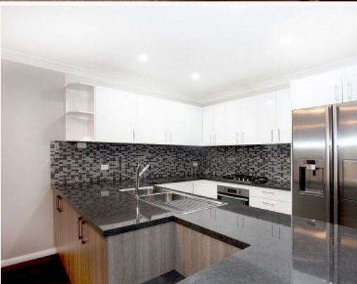
9/3 Bradley Place Liberty Grove, NSW