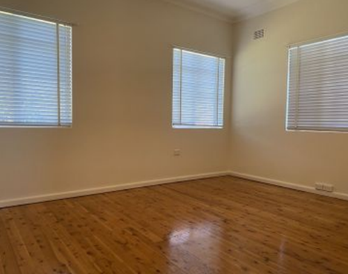
12 Greene Avenue Ryde, NSW