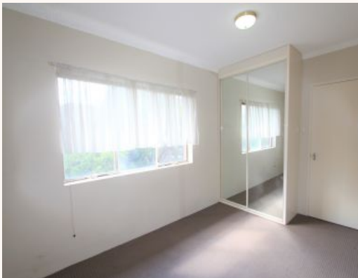
8/20 Bank Street Meadowbank, NSW