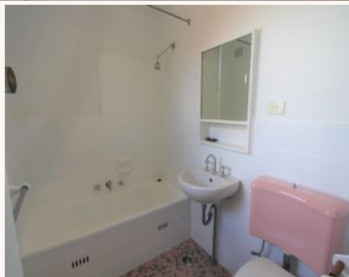
12/26 East Parade EASTWOOD, NSW