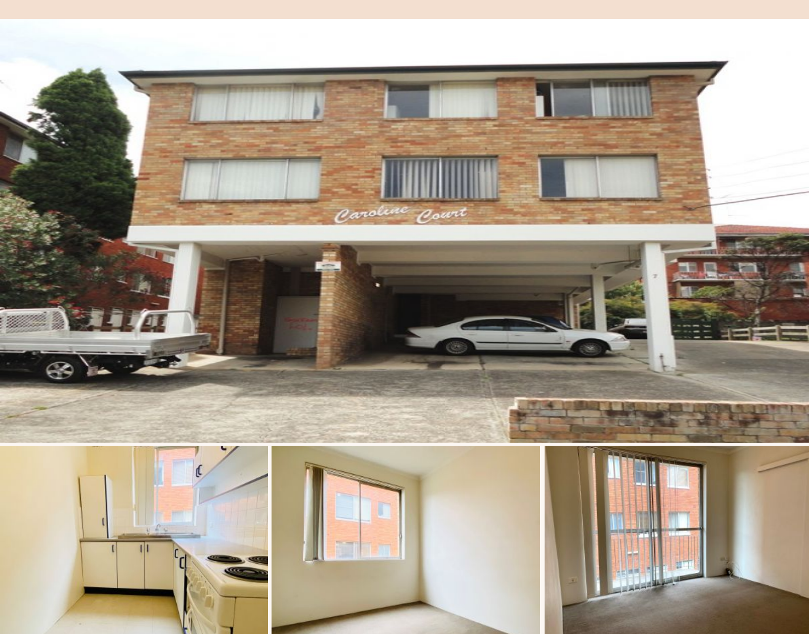
7/7 Reserve Street WEST RYDE, NSW