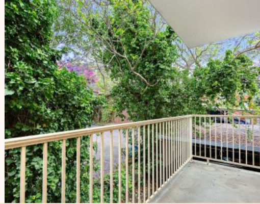
10/8 Isabel Street RYDE, NSW