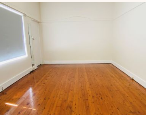
2/6 College Street GLADESVILLE, NSW